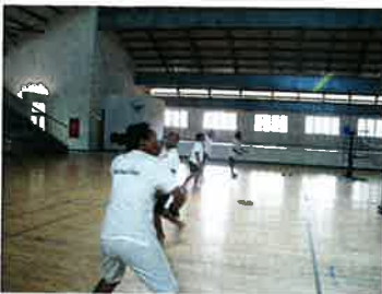
"Te Runga" Tournament

Just before I conclude my report I would like to put up a strong suggestion and big request if the Oceania and World Badminton could consider. We noticed that one of the main problems for the badminton players is the facility. The sport complex is for all sports but sometimes the government uses the complex for other big events which result in stopping all sports from using it. Therefore if the badminton has its own centre then badminton will be a very popular sport in Kiribati as they can use the facility for training, meeting, fund raising and other activities that badminton will benefit from.