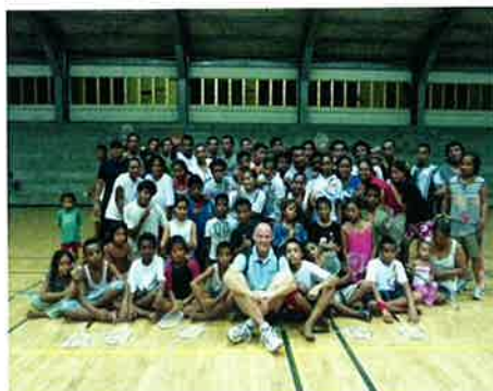
Photo taking after the coaching session