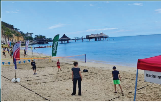
Regular AirBadminton sessions open to the public on the beach in Noumea (NCL)

With increased priority on AirBadminton from the BWF we saw several new initiatives undertaken during 2025; most notably: