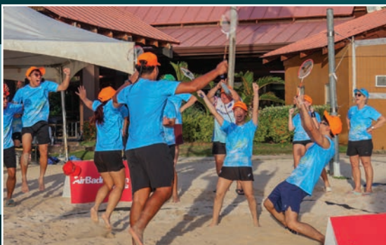
BOC staff implemented an afternoon of AirBadminton on the sand as an introduction to AirBadminton for the players who played in the Oceania Junior Championships. Players were divided into teams, provided with an AirBadminton cap, and played 4 a-side competition which became highly competitive.

Australia held the first AirBadminton National Championships in the region, in Brisbane in June. From this tournament a team went on to represent Australia in the Asia Pacific Championships in Malaysia in August and the BWF AirBadminton World Cup in Sharjah in December. The player experience has been extremely positive with AirBadminton increasing in popularity in Australia.